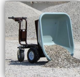
Dump feature for emptying the hopper.

All of our powered carts use an environmentally friendly electric motor. DC Power means no noise, no emissions, no gas, no oil, and no replacing belts or chains. Save time, labor & money with an Overland!