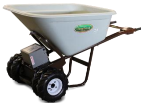
8 cu. ft base model